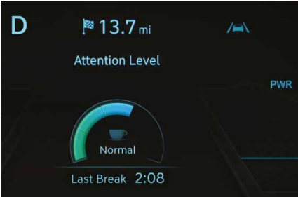
Driver attention warning (DAW)

The new KONA Electric offers you a bountiful selection of desirable features with Apple car play and Android auto is connected wirelessly. Remain fully connected with all your favourite things through wireless phone mirroring.