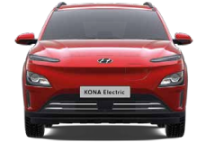
Ultimate Red Metallic