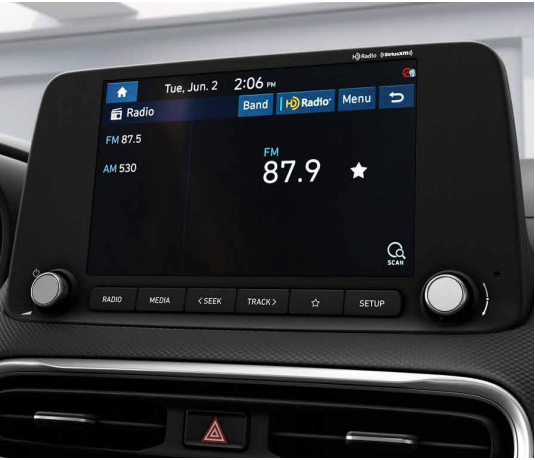
8" Touchscreen Audio Visual Navigation.