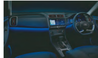
Soothing Blue Ambient Lighting