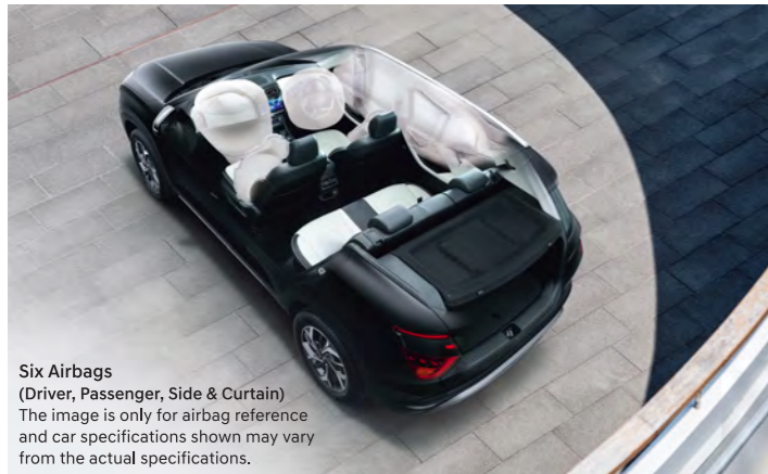
Six Airbags (Driver, Passenger, Side & Curtain) The image is only for airbag reference and car specifications shown may vary from the actual specifications.

A strong body structure made with AHSS, the addition of 4 Rear Parking Sensors and Six Airbags, ensure a secure drive for you and your family every time you hit the road.