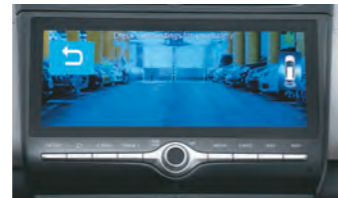
Driver Rear View Monitor