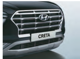
Signature Cascading Grille