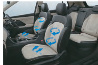
Front Row Ventilated Seats