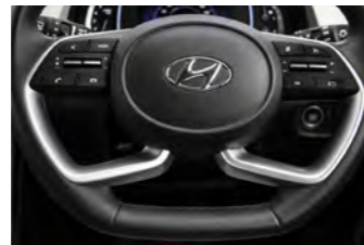
Leather Wrapped Steering with Mounted Controls