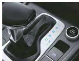
6-speed Intelligent Variable Transmission (IVT)

With Petrol, 1.5 | Petrol and 1.5 | Diesel BS6 engines under the hood, the all-new CRETA delivers a power packed performance on every terrain. Be it on the road or off it, the all-new CRETA has the dynamism to go the distance.