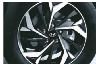
Rear Disc Brake