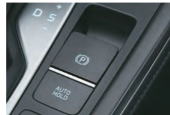
Electric Parking Brake with Auto Hold