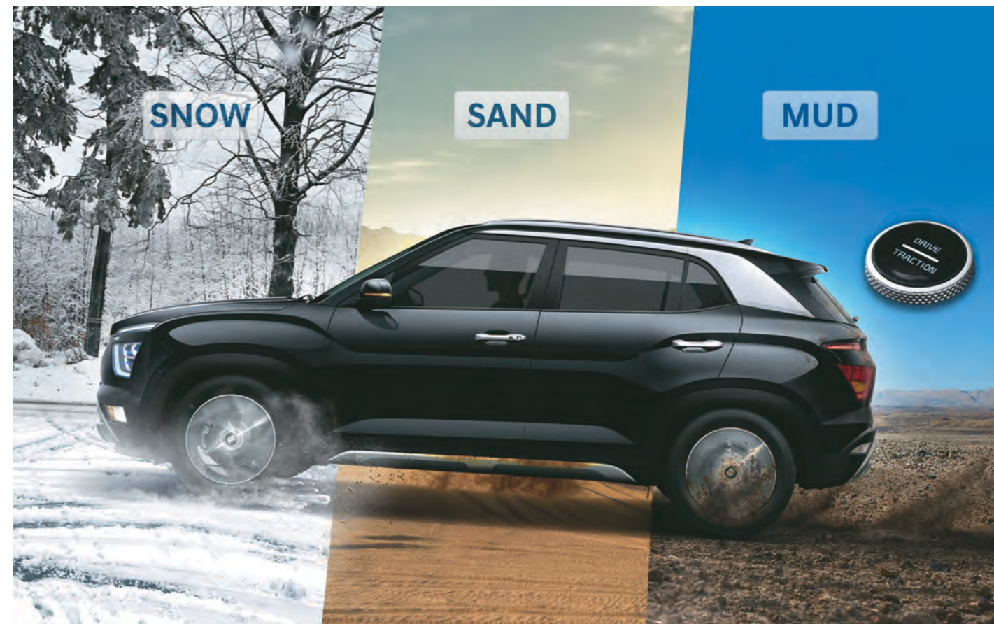
Traction Control Mode (Snow, Sand, Mud)

Max. Power 115ps/4 000 rpm Max. Torque 25.5 kgm/1 500-2 750 rpm 6-speed Manual 6-speed Automatic Transmission