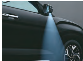
Welcome Function with Auto Unfold ORVM's & Puddle Lamps