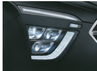
Trio Beam LED Headlamps with Crescent Glow LED DRLs