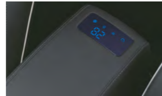
Auto Healthy Air Purifier