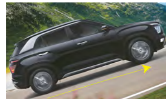
Hill Start Assist Control (HAC)