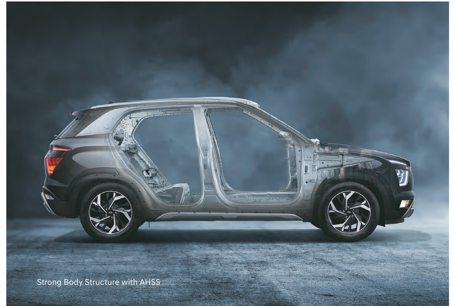
Strong Body Structure with AHSS