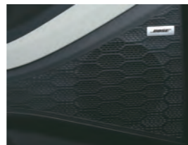
Bose Premium Sound System